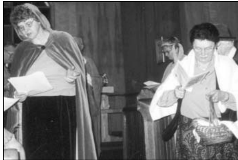
Some World Day of Prayer 2002 participants, like these in Wilberforce, Ontario, chose to tell the story of Abigail through drama.

I went to an 11 a.m. service, which was very well attended. As we entered the church, we were greeted by two friendly ladies wearing special headbands given to them by a Romanian lady in their congregation. They each had a round tray with pieces of French bread; in the centre of the trays were real Romanian salt dishes (from the same Romanian woman) filled with salt. We each took a piece of bread and then dipped