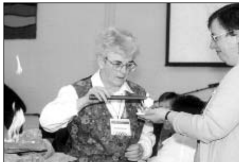
The sharing of the Spirit (symbolized by fire, above) and the celebration of community (through music, below) were vital elements of the weekend theology symposium.

Look for a full report in the upcoming Fall 2003 issue of Making Waves .